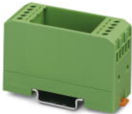
Electronic housing, with snap foot for DIN rail EN 50022 for PCB insertion, without screw connection terminal blocks and cover

Please be informed that the data shown in this PDF Document is generated from our Online Catalog. Please find the complete data in the user's documentation. Our General Terms of Use for Downloads are valid ( http://download.phoenixcontact.com )