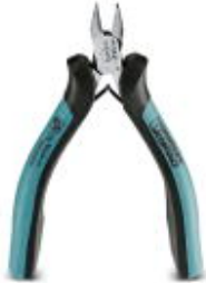
Electronic diagonal cutter, tapered head, angled (21°), without chamfer, with opening spring

Please be informed that the data shown in this PDF Document is generated from our Online Catalog. Please find the complete data in the user's documentation. Our General Terms of Use for Downloads are valid ( http://download.phoenixcontact.com )