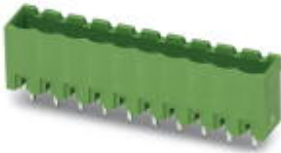
Header, Nominal current: 12 A, Rated voltage (III/2): 320 V, Number of positions: 10, Pitch: 5 mm, Color: green, Contact surface: Tin, Assembly: Soldering

Please be informed that the data shown in this PDF Document is generated from our Online Catalog. Please find the complete data in the user's documentation. Our General Terms of Use for Downloads are valid ( http://download.phoenixcontact.com )