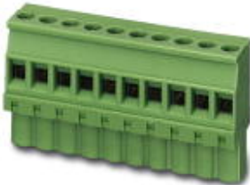
Plug component, Nominal current: 12 A, Rated voltage (III/2): 320 V, Number of positions: 8, Pitch: 5.08 mm, Connection method: Screw connection, Color: green, Contact surface: Tin

Please be informed that the data shown in this PDF Document is generated from our Online Catalog. Please find the complete data in the user's documentation. Our General Terms of Use for Downloads are valid ( http://download.phoenixcontact.com )