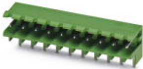
Header, Nominal current: 12 A, Rated voltage (III/2): 320 V, Number of positions: 3, Pitch: 5 mm, Color: green, Contact surface: Tin, Assembly: Soldering

Please be informed that the data shown in this PDF Document is generated from our Online Catalog. Please find the complete data in the user's documentation. Our General Terms of Use for Downloads are valid ( http://download.phoenixcontact.com )