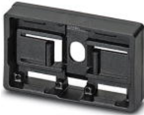
Marker carriers, black, Unlabeled, Mounting type: Screws, rivets, Lettering field: 27 x 15 mm

Please be informed that the data shown in this PDF Document is generated from our Online Catalog. Please find the complete data in the user's documentation. Our General Terms of Use for Downloads are valid ( http://download.phoenixcontact.com )