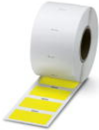
Label, Roll, yellow, Unlabeled, Can be labeled with: THERMOMARK ROLL, THERMOMARK X, THERMOMARK S1.1, Mounting type: Adhesive, Lettering field: 51 x 25 mm

Please be informed that the data shown in this PDF Document is generated from our Online Catalog. Please find the complete data in the user's documentation. Our General Terms of Use for Downloads are valid ( http://download.phoenixcontact.com )