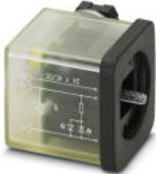
Valve connector, 3-pos., type A, 1 LED, with protective circuit, screw connection, cable screw connection M16

Please be informed that the data shown in this PDF Document is generated from our Online Catalog. Please find the complete data in the user's documentation. Our General Terms of Use for Downloads are valid ( http://download.phoenixcontact.com )