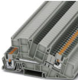
Installation level terminal block, Push-in connection, Cross section: 0.14 mm 2 - 4 mm 2 , AWG: 26 - 12, Width: 5.2 mm, Color: gray, Mounting type: NS 35/7,5, NS 35/15

Please be informed that the data shown in this PDF Document is generated from our Online Catalog. Please find the complete data in the user's documentation. Our General Terms of Use for Downloads are valid ( http://download.phoenixcontact.com )