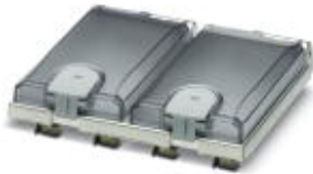
Mounting frame, for two front plates or sockets, metal frame, matt nickel-plated, electrically conductive, transparent cover

Please be informed that the data shown in this PDF Document is generated from our Online Catalog. Please find the complete data in the user's documentation. Our General Terms of Use for Downloads are valid ( http://download.phoenixcontact.com )