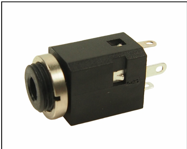
Part No. FC681374V