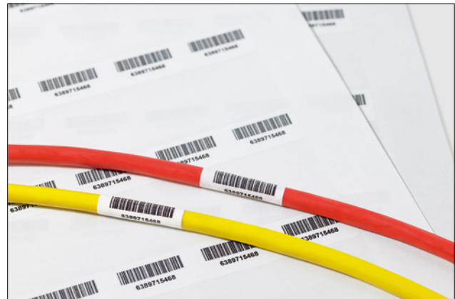
Laminating the mark gives long-term print survivability.