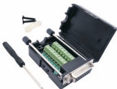
T1904C095 - Female connector with locking screw connection

Included accessories 1x Screw driver 1x Cable strain Relief 2x Fastening screw