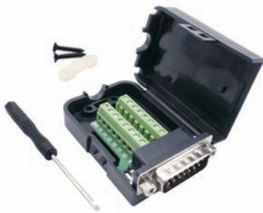
T1904C092 - Male connector with jackscrew nut connection