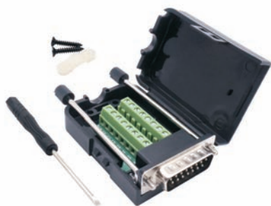
T1904C094 - Male connector with locking screw connection