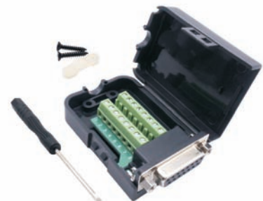
T1904C093 - Female connector with jackscrew nut connection